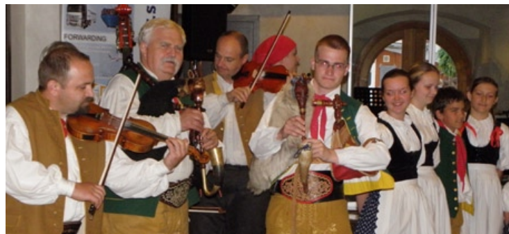
Folklore - music and dance performance

Contact: BTG Internationale Spedition GmbH Filsallee 1 73207 Plochingen Tel.: +49 7153/83 45 - 0 Fax: +49 7153/83 45 - 90 E-mail: plochingen@btg.de