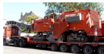
Asphalt cutting machine

It doesn't always have to be an asphalt cutting machine going to Kazakhstan (Customer: „Michael Zeiler machines,“ Gemünden www.mz-machines.com ) or a furnace of 6.21 m width