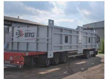
Loading of the furnace

(Customer: INTEC, Niederzier www.intec-solutions.de ) as the pictures might suggest!