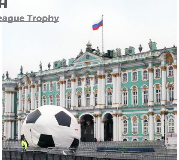
UEFA Champions League Trophy Tour 2011 in front of the Winter Palace in St. Petersburg

At each stop three complete trucks and several air freight shipments were handled.